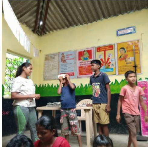
I learn most when i do it myself observed white, red, pink flower petals.[/caption][caption id="attachment_54354" align="alignnone" width="300"]