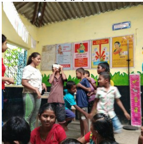
Handheld Foldscope but no handholding ask, seek, explore.[/caption][caption id="attachment_54356" align="alignnone" width="300"]