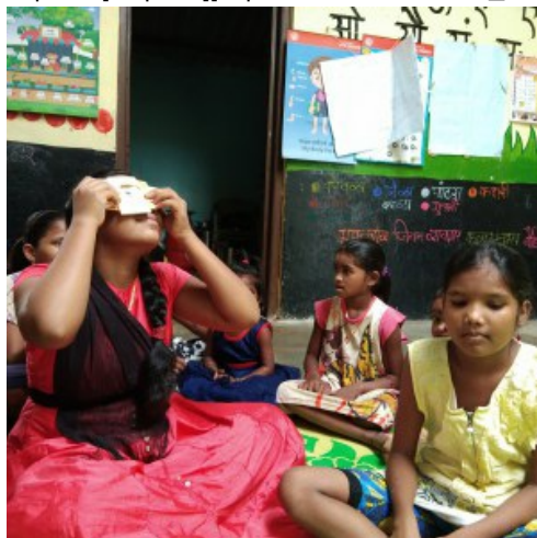
Science for all microcosm envelopes us all, Commerce 12th grade student explores on her own using Foldscope.[/caption][caption id="attachment_54357"